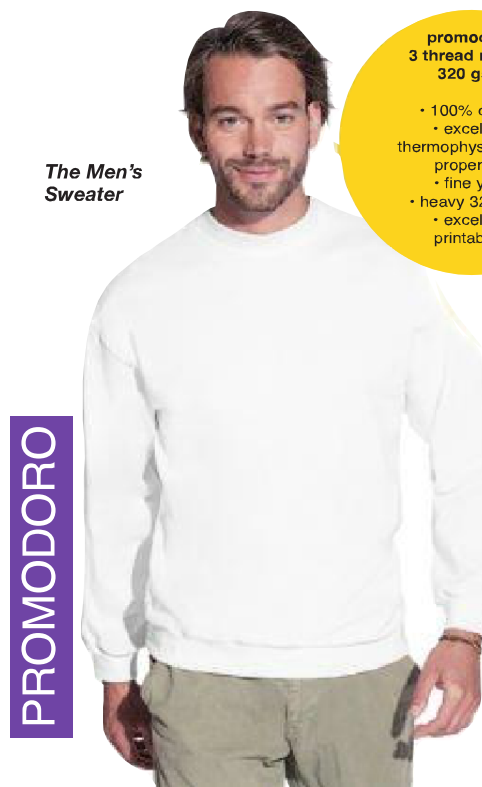
The Men's Sweater