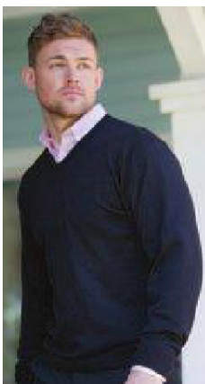
710M Russell Collection Men's V-Neck Knitted Pullover

For more information call 0800 012 4542, email sales15@btactivewear.co.uk or visit www.btactivewear.co.uk